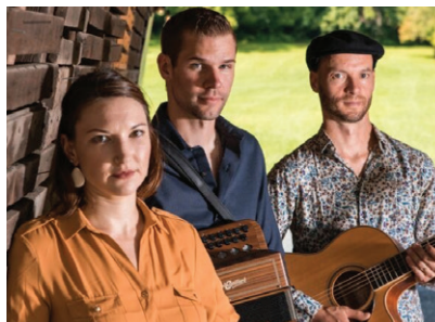
Poor Man's Gambit