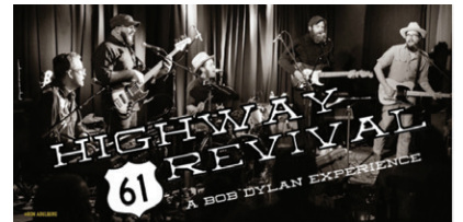
Highway 61 Revival