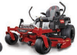
54" TITAN 75312