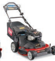
TIME MASTER 21199