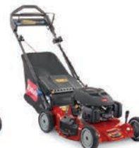
SUPER RECYCLER 20383