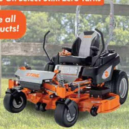
Zero Turn Mowers