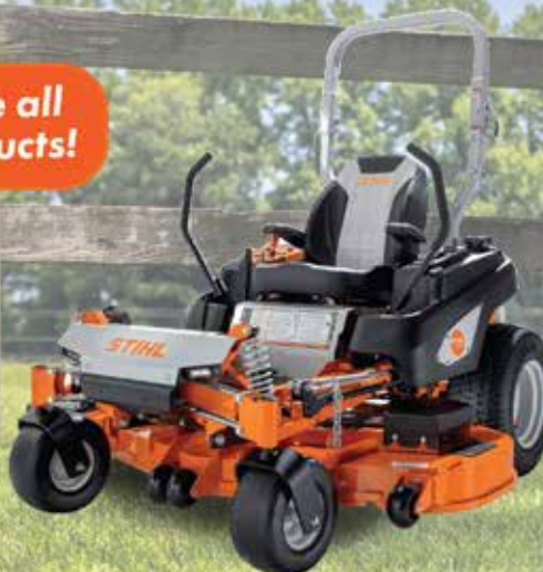
Zero Turn Mowers